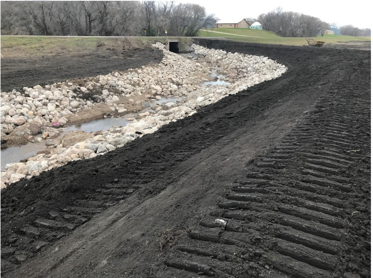
11/10/21: Rock Riffle 8 & 9 After topsoil spreading