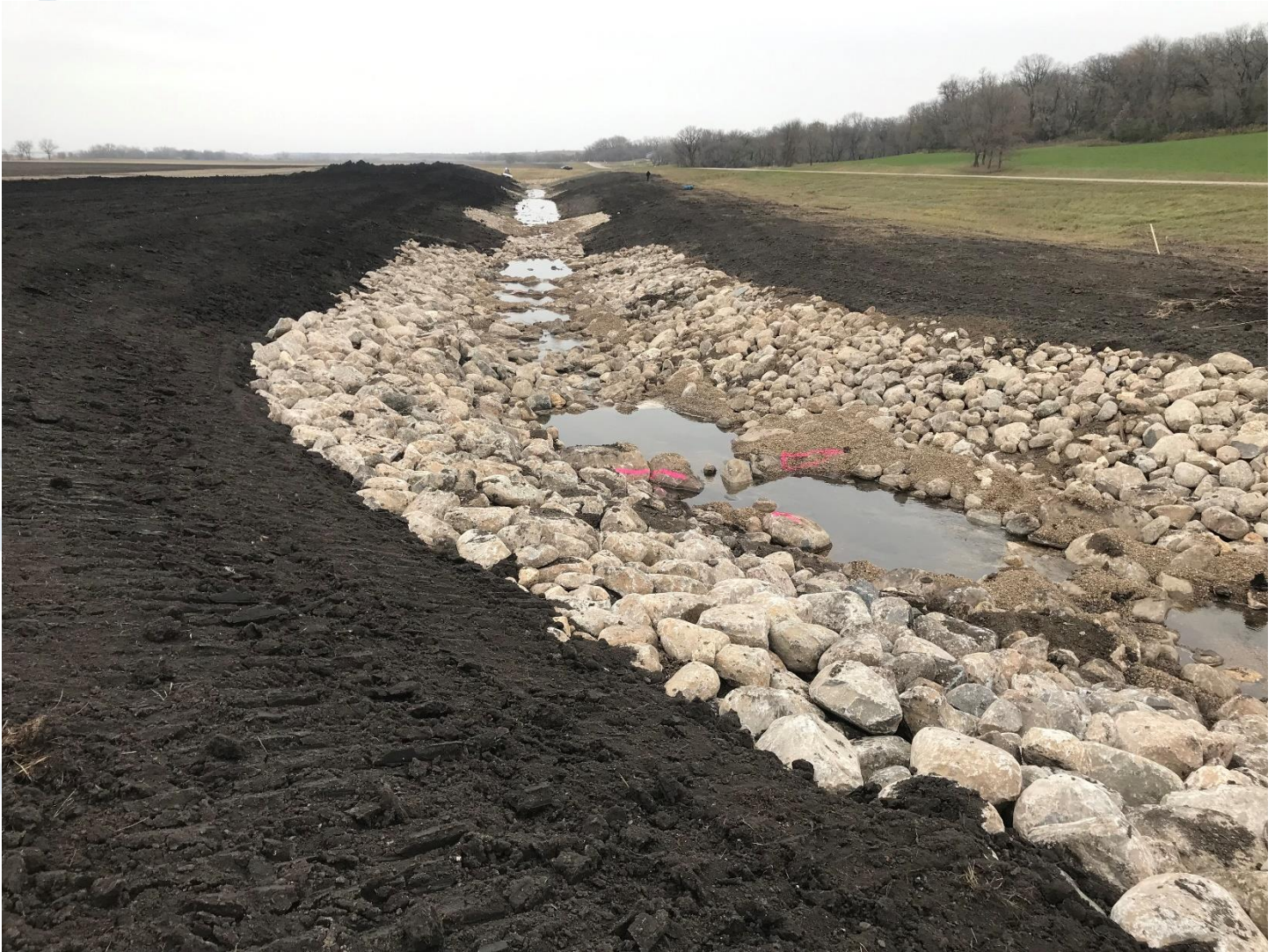
11/10/21: Looking Northeast along Highway 27 after topsoil spreading