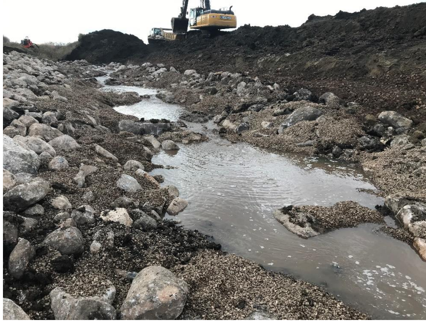
11/08/21: Construction of Rock Riffle 6