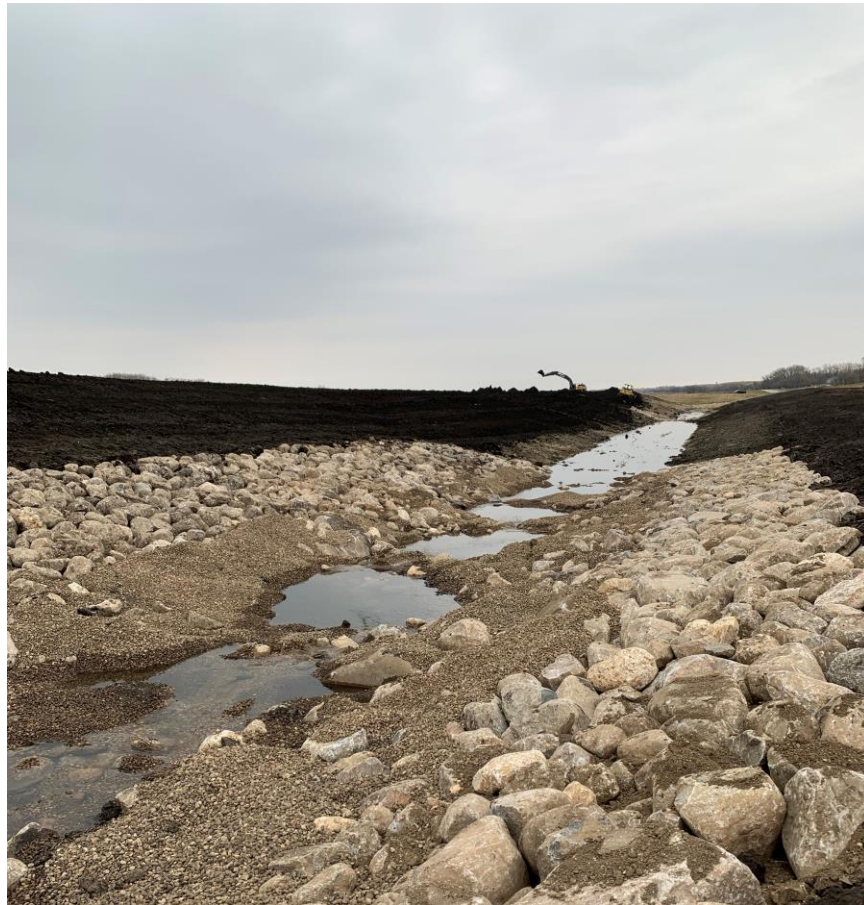
11/10/21: Topsoil Spreading